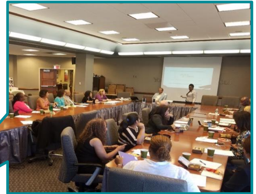
Yonkers Basics Advisory Board meeting