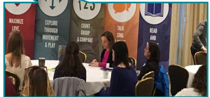
Palmetto Basics Kickoff (South Carolina)

The Basics Learning Network brings together cities, towns, and counties in the U.S. and abroad where civic-sector leaders have adopted the five Basics as a framework for infant and toddler caregiving. As the work develops across the Network, the Basics Community Toolkit and other collaborative resources and activities provide ongoing opportunities to accumulate and share emerging lessons to maximize the collective impact of our work.